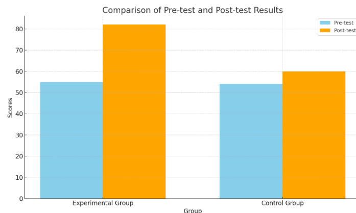
Figure 2. Graph Comparison of Pre-test and Post-test Results.

To provide a clearer illustration of the comparison between the pre-test and post-test results for the experimental and control groups, the following graph displays the differences observed in their performance.