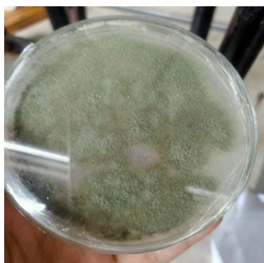
Figure 3. Misellium of Trichoderma sp.