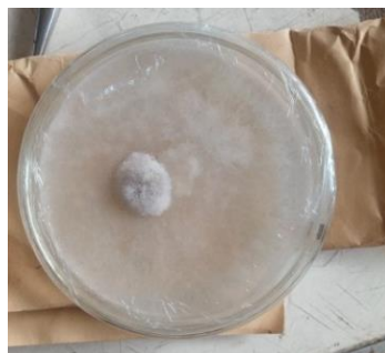
Figure 2. Misellium of Colletotrichum Gloeosporioides

From the results of observations of the isolation of the pathogenic fungus that causes dragon fruit vine rot, macroscopically there is a mycelium consisting of white hyphal threads arranged like feathers, and after a few days the hyphae turn black, visual observation can be seen in Figure 2.