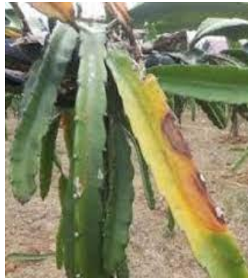
Figure 1. Dragon Fruit Stems Infected With Yellow Rot Disease

Stem rot disease in dragon fruit plants is the main problem for dragon fruit farmers in Tanjung Selamat Village, Medan Tuntungan District, Medan Regency.