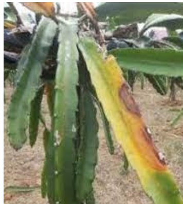
Figure 1. Dragon Fruit Stems Infected With Yellow Rot Disease

Stem rot disease in dragon fruit plants is the main problem for dragon fruit farmers in Tanjung Selamat Village, Medan Tuntungan District, Medan Regency.