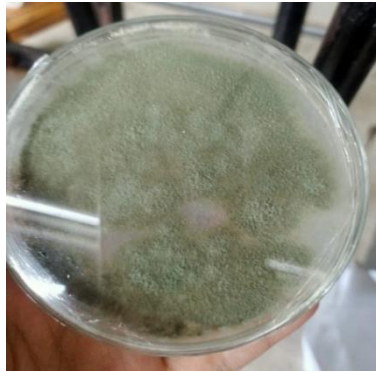
Figure 3. Misellium of Trichoderma sp.