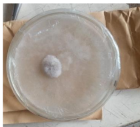
Figure 2. Misellium of Colletotrichum Gloeosporioides

From the results of observations of the isolation of the pathogenic fungus that causes dragon fruit vine rot, macroscopically there is a mycelium consisting of white hyphal threads arranged like feathers, and after a few days the hyphae turn black, visual observation can be seen in Figure 2.