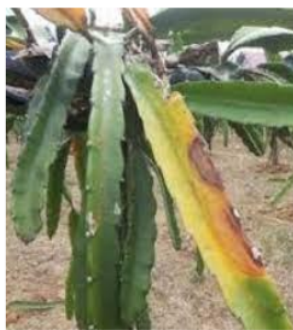
Figure 1. Dragon Fruit Stems Infected With Yellow Rot Disease

Stem rot disease in dragon fruit plants is the main problem for dragon fruit farmers in Tanjung Selamat Village, Medan Tuntungan District, Medan Regency.